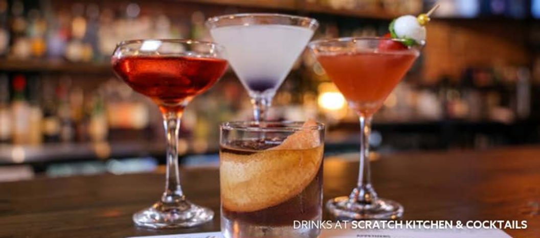
DRINKS AT SCRATCH KITCHEN & COCKTAILS