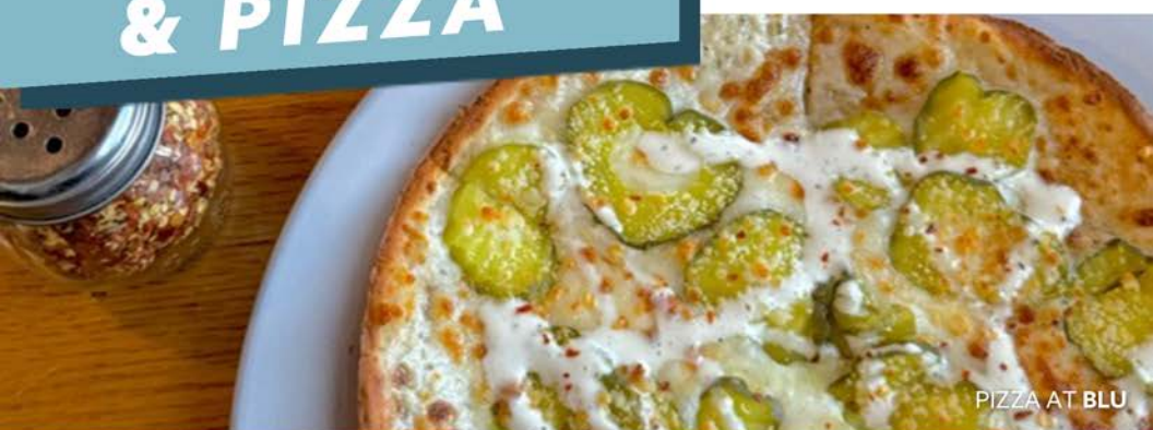
PIZZA AT BLU