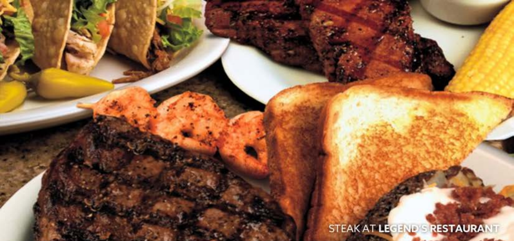
STEAK AT LEGEND'S RESTAURANT