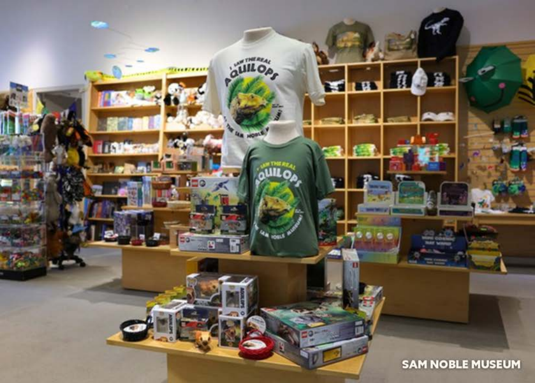
SAM NOBLE MUSEUM