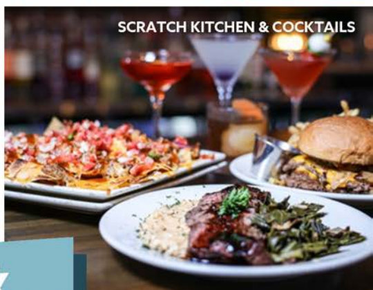
SCRATCH KITCHEN & COCKTAILS