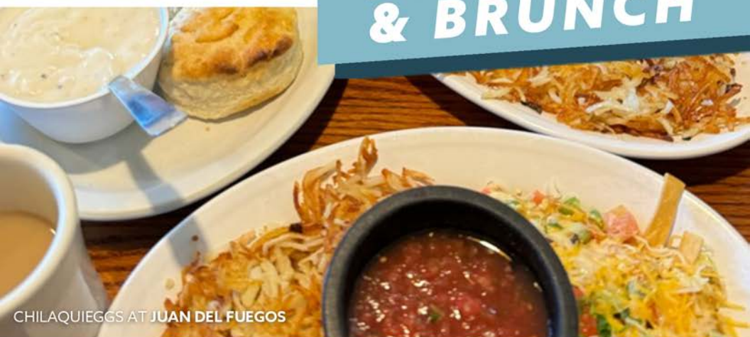
CHILAQUIEGGS AT JUAN DEL FUEGOS