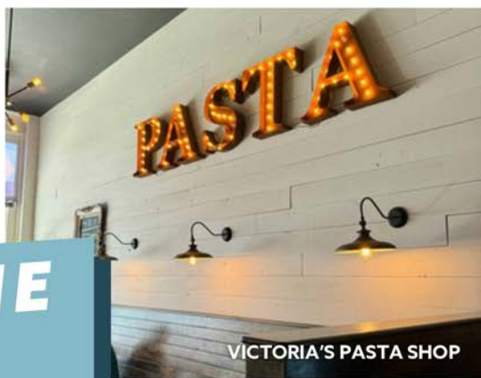
VICTORIA'S PASTA SHOP