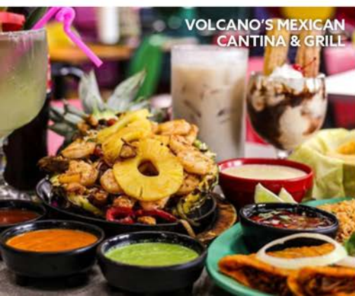
VOLCANO'S MEXICAN CANTINA & GRILL