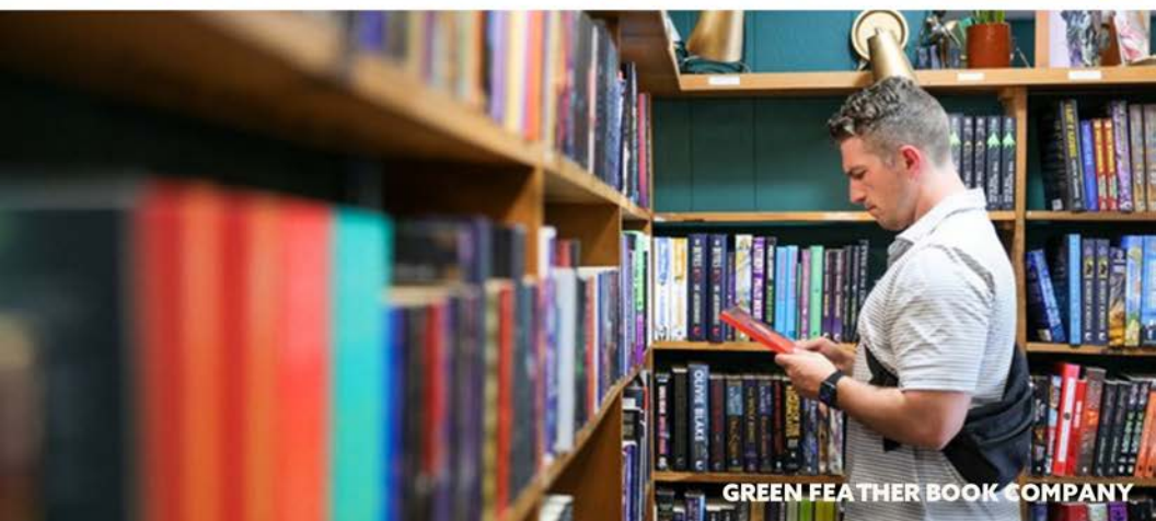
GREEN FEATHER BOOK COMPANY