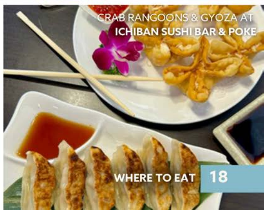
CRAB RANGOONS & GYOZA AT ICHIBAN SUSHI BAR & POKE